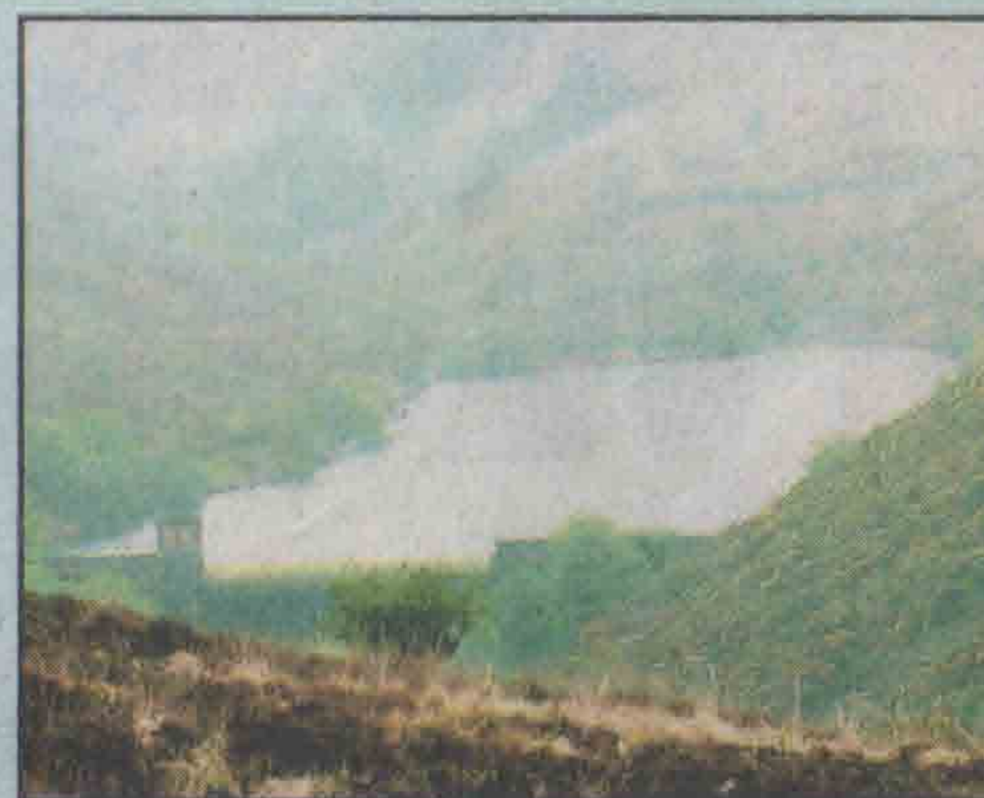
Picturesque: A view of Nutscale Reservoir

The heather holds calves, hidden from the eye, Unknown to people, strangers passing by. But when the mother returns, They rise up from the ferns. As Exmoor ponies gather with foals by their side, The sun warms their body as it stretches far and wide. Foals stay close to their warm, safe mothers, As they jump around, playing with their brothers. This is the joy that Exmoor brings, From the great stag grunting, To the first bird that sings.